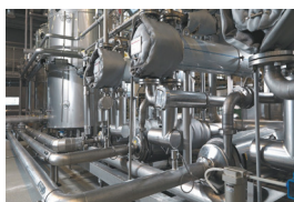
Commercial & Domestic HVAC

A world leader in digital thermometers, Rototherm has become the standard for accurate and reliable measurement across the following industries: