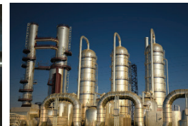
Chemical, Petrochemical & Pharmaceutical