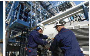
Heating & cooling Systems & Pipework