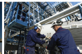
Heating & cooling Systems & Pipework