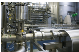
Food Industry, Dairies & Breweries

A world leader in temperature gauges, Rototherm has become the standard for accurate and reliable measurement across the following industries: