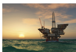
On/Offshore Environments & Refining