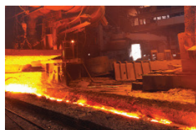
Ovens, Dryers & Tanks